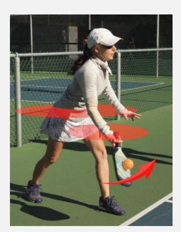
Figure 4-3 (legal serve)

(Photos and graphics courtesy of Steve Taylor, Digital Spatula)