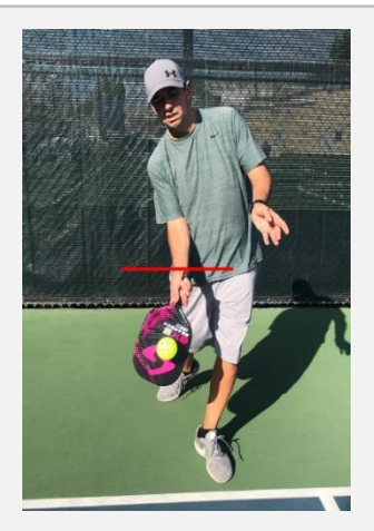
Figure 4-1 (legal serve)

4.A.6. The highest point of the paddle head must not be above the highest part of the wrist (where the wrist joint bends) when it strikes the ball. (See Fig 4-1 & 4-2)