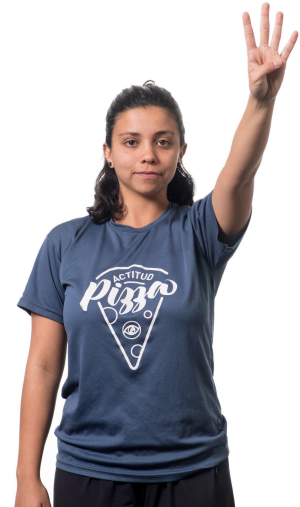
Announce stall (use appropriate number of fingers)