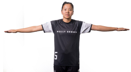
Retraction (3 swipes)