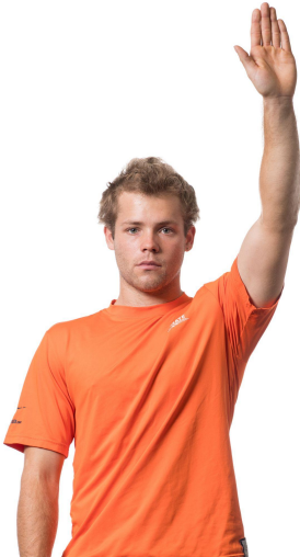
Call on field