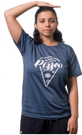
Stall or time violation