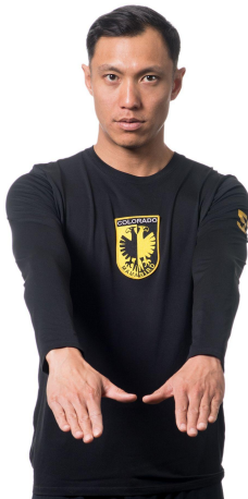
In the end zone