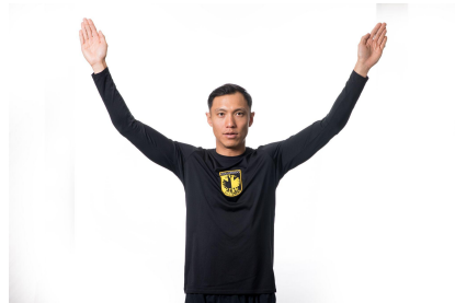
Play has stopped