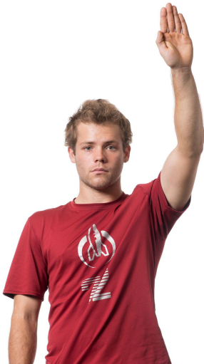
Readiness or brick