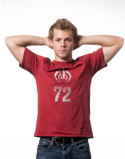
Gender ratio: 4 men-matching players