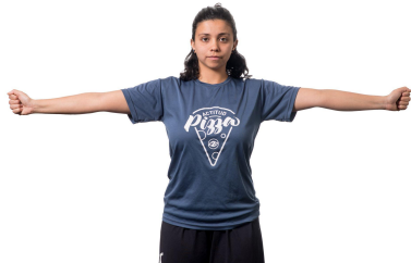
Gender ratio: 4 women-matching players