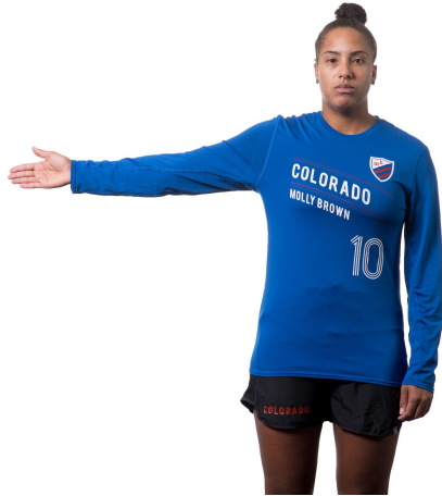
In- or out-of-bounds