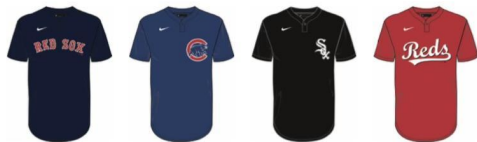
Boston Red Sox N383-44B-BO-J82 Midnight Navy