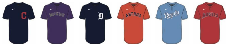
Cleveland Indians N383-44B-ID5-J82 Midnight Navy