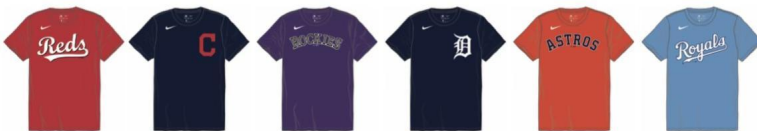
Cincinnati Reds N223-62Q-RED-J74 NY23-62Q-RED-J74 N199-62Q-RED-J81 NY28-62Q-RED-J81 Sport Red