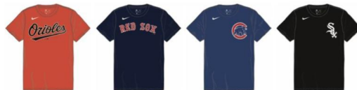
Baltimore Orioles N223-89L-OLE-J74 NY23-89L-OLE-J74 N199-89L-OLE-J81 NY28-89L-OLE-J81 Team Orange