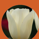
CITY OF VANCOUVER