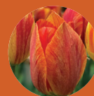
RHAPSODY OF SMILES