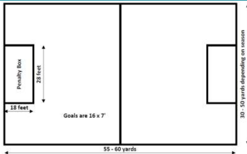
Dimensions of one of the smaller fields