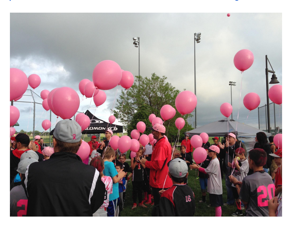
Opening Ceremonies May 30th, 2014

https://www.teamsideline.com/sites/ThunderBaseballLeague/donations