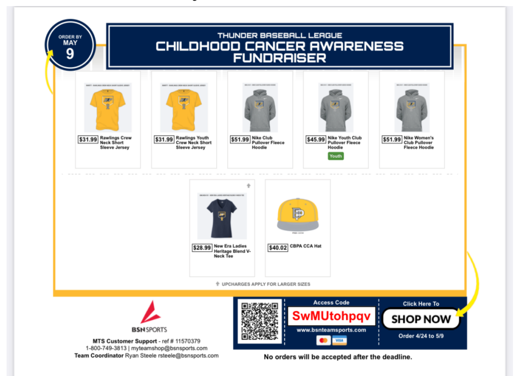
Click Flyer or scan QPC to order

May is Brain cancer awareness month, and May 17th is DIPG awareness day. DIPG is a terminal, aggressive type of brain tumor that typically affects children. In May of 2014 alone DIPG took 2 amazing children from our broomfield community. Our organization has had more than a handful of families affected by childhood cancer and we are committed to helping find a cure and helping families in their battle against childhood cancer.