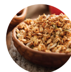
sprinkle of cereal or nuts