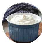
plain or vanilla yogurt