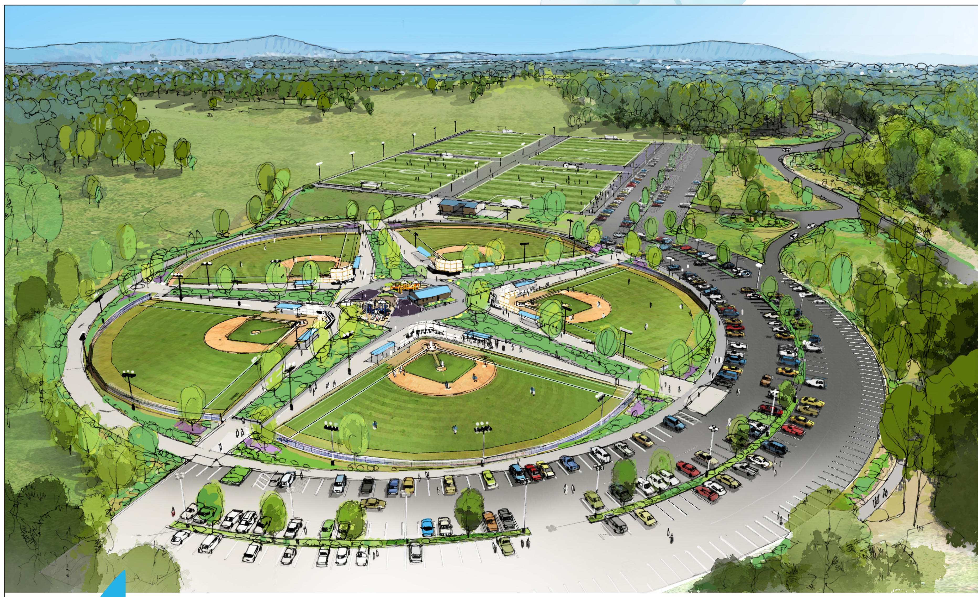
Image provided by Hopper Design + Illustration & Robertson Sherwood Architects

$20 per month (about four medium mochas for the average homeowner)